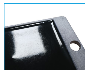
Epoxy filled casing

Can be used on fridge elements up to 170 Watts max